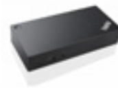
ThinkPad USB-C Dock 40A90090XX