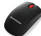
Lenovo Laser Wireless Mouse