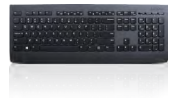
Lenovo Professional Wireless Keyboard