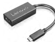
USB-C to HDMI Adapter